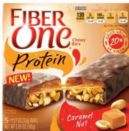
This product representing the trend of fiber + proteins

New North American product launches tracked containing fibers demonstrated an 8% overall increase from H1 2014 to H1 2015. The top category for tracked launches utilizing fiber ingredients in the region was cereals (23%), with inulin being the leading fiber ingredient tracked. The fiber ingredients to demonstrate the most growth were resistant dextrin (+23%) and inulin (+23%).